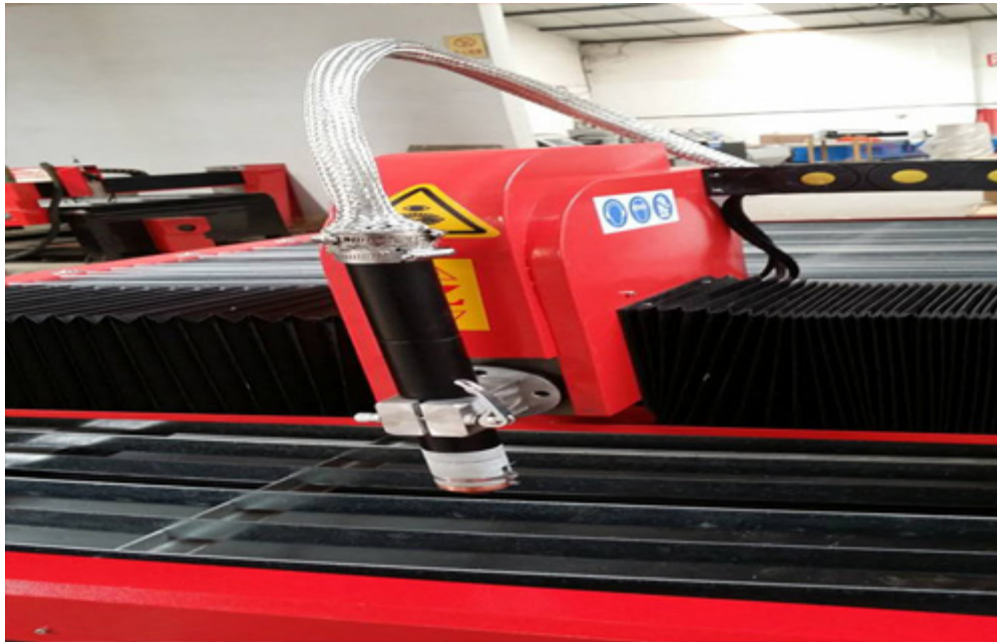
Cutting torch: Different power with different cutting torch.