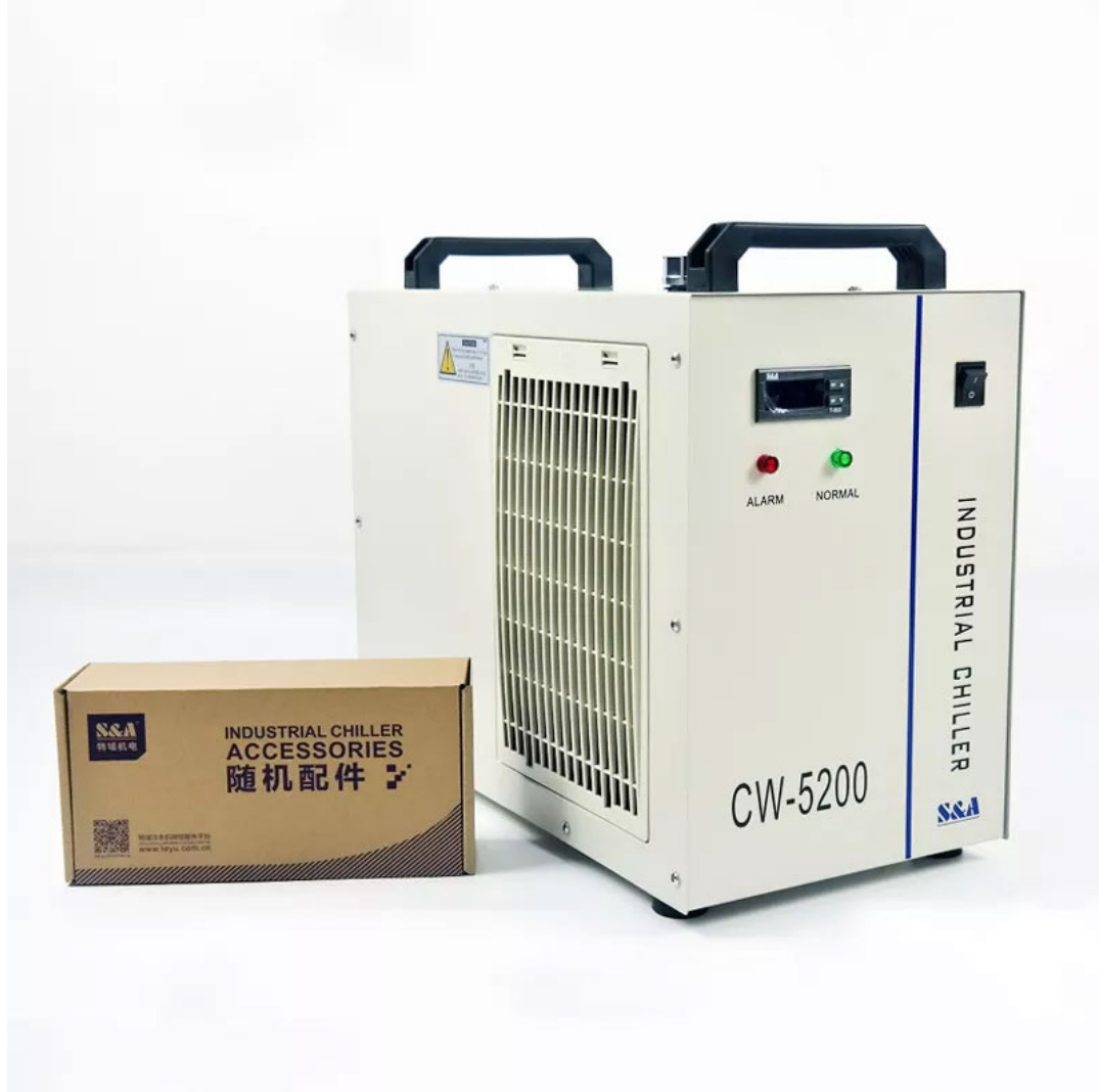
4/ Teyu S&A Brand water chiller CW-5000 or CW-5200